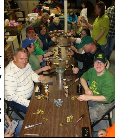
Our workers gather all the parts they need to build their trophies

Orders are taken at our offices at 255 Estatoa Street in Newland where customers can select from a wide variety of styles and sizes with decorations ranging from basketballs to fishing poles, kids kicking soccer balls to dogs treeing a raccoon . All trophies are individually engraved. Engraved plaques and medallions are also available through Yellow Mountain Trophies. Even a large order of trophies can usually be filled in less than a week.