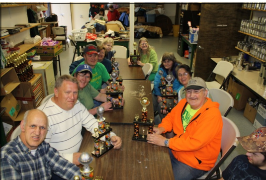
After all the trophies in the order are built, our workers can feel satisfied by a job well done